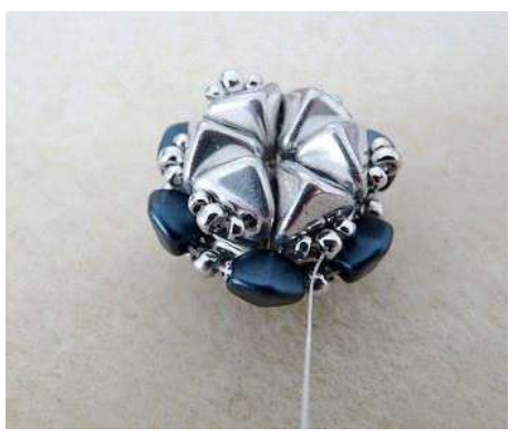
9) Now we will connect the two parts. For this, put one over another.