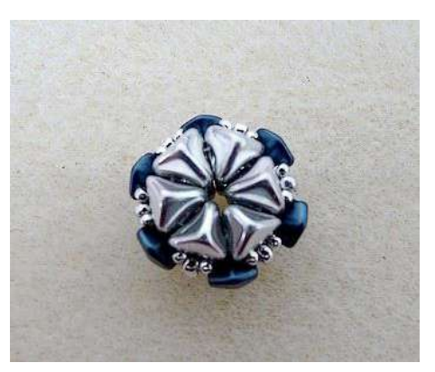
12) You get the first Caline.