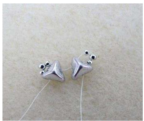
2) Repeat steps 1.