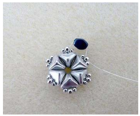
5) Add 1 P between the SB11's.