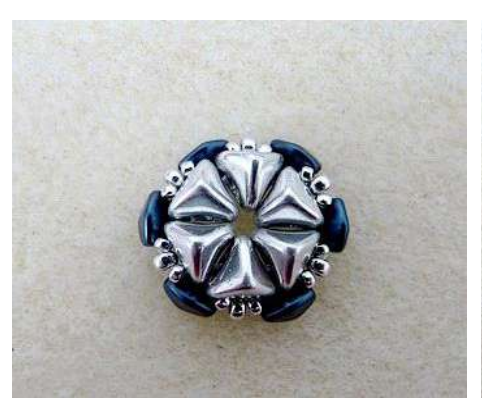
7) We close the thread.