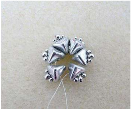
3) Make a total of 6 elements in same way like in step 1.