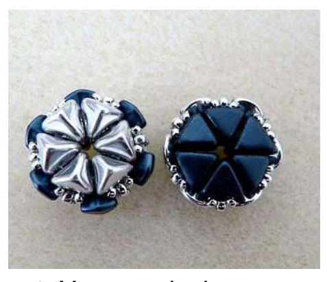
13) You can do the same thing with Kheops®.

The « Calines » pearls allows you to make necklace, bracelet, earring, bag jewelry etc