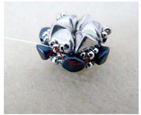
10) Pass through the P and connect with SB11 in front. Go around as well.