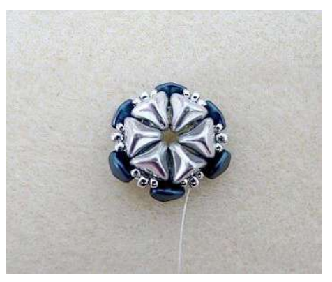
6) Hold tight! We will have this.