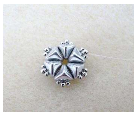
4) Tie a knot, tighten and go out through SB11.