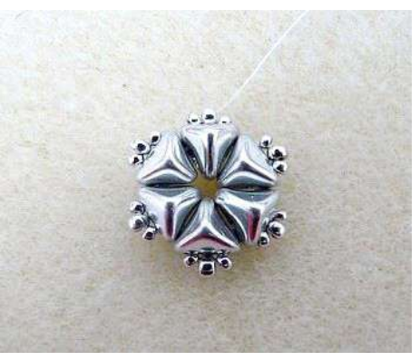
8) Repeat steps 1 to 4. Pass through SB11.