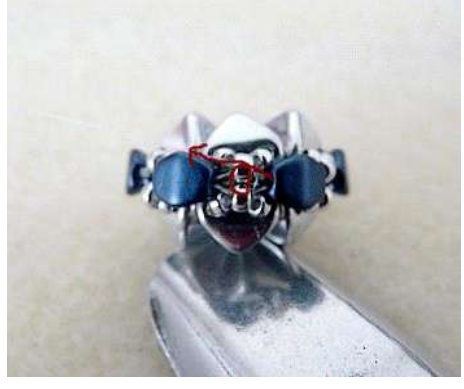
11) Pass through the two SB11's to connect them and go around as well.